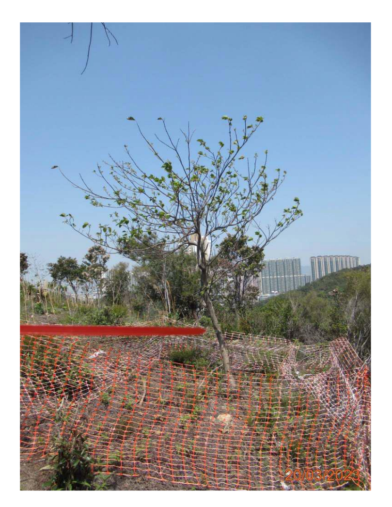
Photo 1 – Tree protection zone for preserved plant species of conservation importance